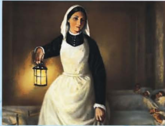
Pioneer of Modern Nursing Lady with the Lamp Florence Nightingale Born : May 12, 1820 at Florence, Italy Died : August 13, 1910 at London, England

I solemnly pledge myself before God and in the presence of this assembly, to pass my life in purity and to practice my profession faithfully.